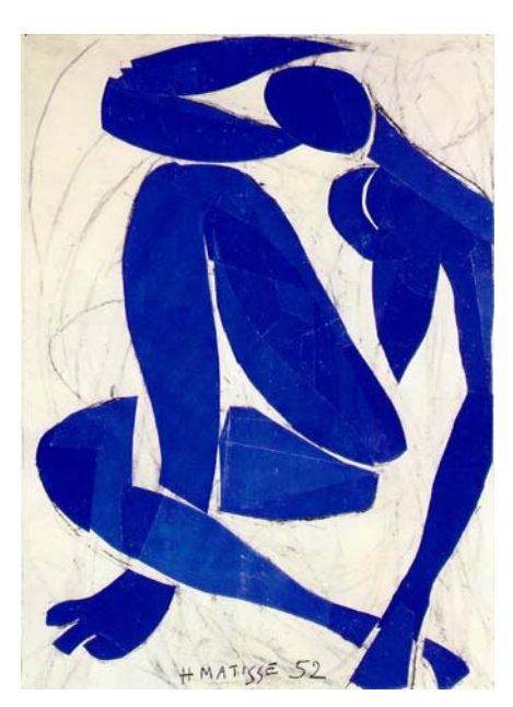
Fig. 1. Henri Matisse, Naked blue IV, 1952, paper cut outs, Nice (© Succession Henri Matisse)

Abstraction is widely used in other disciplines such as art and music. For instance, as shown in Figure 1, Henri Matisse manages to clearly represent the essence of his subject, a naked woman using only simple lines or cutouts. His representation removes all detail yet conveys much. In his painting, South Wind, Clear Skies (Red Fuji), Katsushika Hokusai captures Mount Fuji (Figure 2); an art commentator