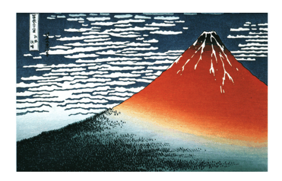
Fig. 2. Katsushika Hokusai, 'South Wind, Clear Sky' ( Gaifû kaisei ) ['Red Fuji'], a colour woodblock print, Japan, AD 1830-33

(Gabrielle Farran) remarks that he uses a "perfect balance of colour and composition rendering an abstract form of the mountain to capture its essence".